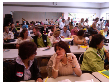
WITS 2010 Annual Meeting

I will close for now by reiterating my invitation for you to let me know what you would like to see WITS Advocacy work on. My contact information is found on page 2 of this newsletter, as is that of our president, board members, and other officers.