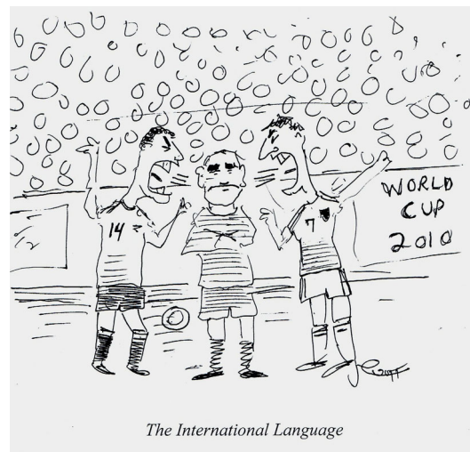
The International Language

If the interpreter already knew that the gang reference was to be excluded, should the interpreter have stopped interpreting on his/her own? Of course not. It is not the interpreter’s role to decide which information is or is not admissible. The interpreter should continue to give a complete and accurate interpretation, unless instructed by the judge not to.